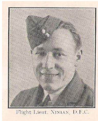
Flight Lieutenant Royal Air Force

Flight Engineer on Halifax aircraft. Flew on 36 bombing raids over Germany. Awarded D.F.C. following an operation in which only two out of crew of seven remained alive.