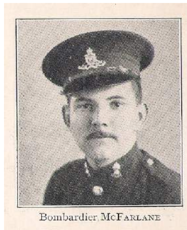
Bombardier Royal Artillery

Accidentally killed while on active service in south of England, 22/8/41