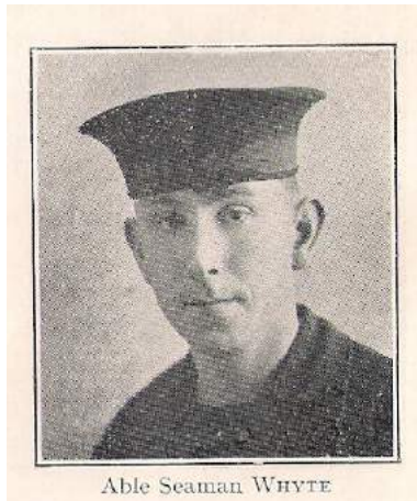
Able Seaman Royal Navy

Served on HMS Hood (two years) and HMS Aurora. Killed in action on board the latter in the Mediterranean, 30/10/43