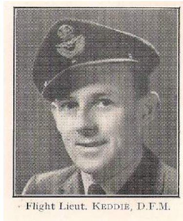
Flight Lieutenant (Air Observer) Royal Air Force

Awarded D.F.M. for services in the Battle of the Ruhr. Brought down over Berlin in Lancaster bomber, September, 1943, and P.O.W. till end of war.