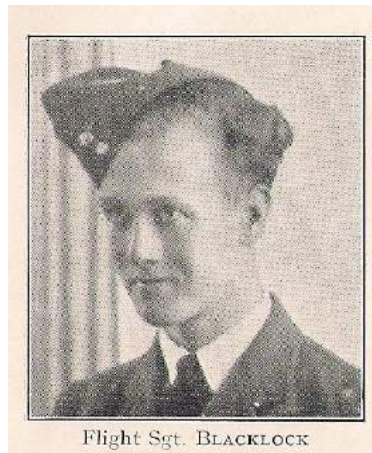
Flight Sergeant (Pilot) Royal Air Force

Coastal Command. Engaged with M.E.F. in anti-submarine patrols and mine-laying expeditions. Reported missing, later presumed killed, while mine-laying in the Aegean Sea round the Balkan coasts, 6/5/44