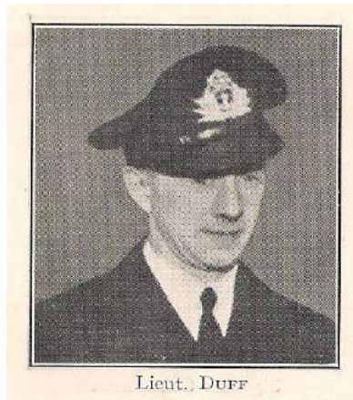
Lieutenant (Engineer) Royal Naval Reserve

On board HMS Scotstoun (Anchor liner Caledonia) when she was torpedoed, 13/6/40. Subsequently on HMS Mooltan and HMS Manistee, in the latter of which he lost his life when she was sunk by enemy action, 24/2/41.