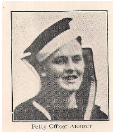
Petty Officer (Pilot) Fleet air Arm

Killed in a flying accident while training in the Orkneys, 2/5/45