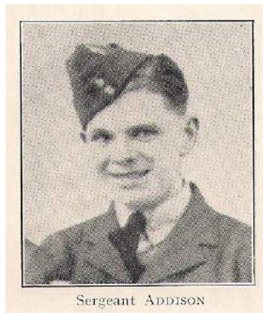
Sergeant (Air Gunner) Royal Air Force

487 Squadron, Methwold, Norfolk. Missing on bombing raid when Ventura aircraft encountered enemy aircraft near Amsterdam, the target area, 3/5/43. Whole crew reported killed in official German statement to the International Red Cross. Buried in Amsterdam