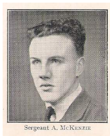
Sergeant (Flight Engineer)