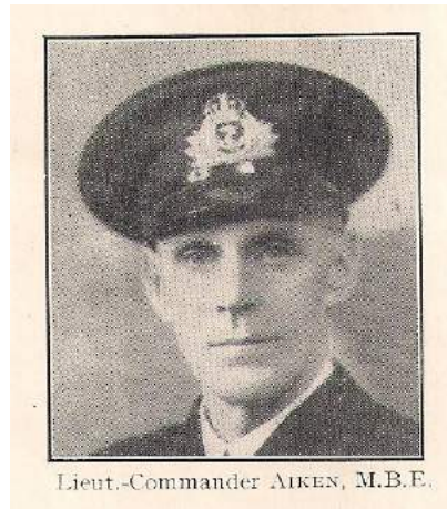
Lieutenant-Commander (Engineer) Royal Navy

Served in RASC and Royal Marines in 1914-18 War. In Blue Funnel Line before the war, when his ship, the Glenearn, was requisitioned by the Admiralty as an auxiliary cruiser. Awarded MBE for services at the evacuation of Crete. Transferred to Prince Baudouin, in which he carried American Rangers to France on D-Day, and took part in the landings in the south of France. Transferred to Pacific on the Glenearn, where he met his death (April 1945), following a fire on board, by being caught in an explosion when he went down to shut off the petrol tanks. Buried at Lae, New Guinea