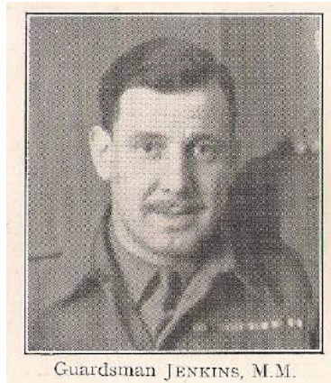
Guardsman Scots Guards

Awarded M.M. as N.C.O. in charge of an anti-tank gun crew which helped to stem a German panzer attack in North Africa.