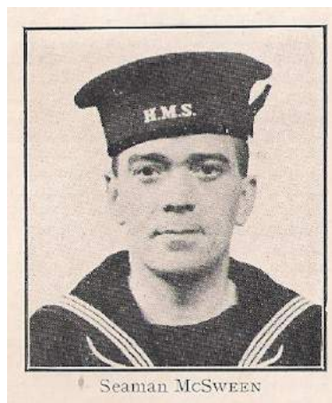
Ordinary Seaman Royal Navy

Died in Leys Hospital, Cambs., after three months' service, 13/12/41