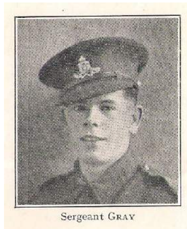
Serjeant Royal Artillery

Warrant Officer (Navigator) Royal Air Force