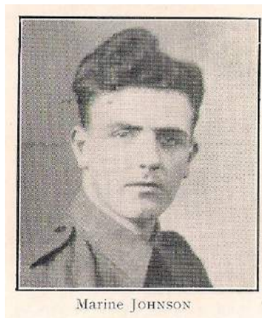
Marine Royal Marines

Killed in action under shell-fire, Normandy, 8/8/44