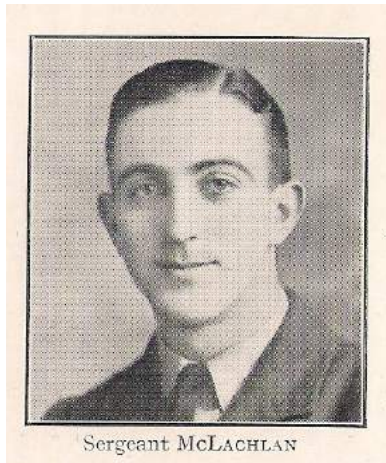
Sergeant (Navigator) Royal Air Force

Killed in a crash, Herefordshire, on an investigation flight, 25/1/43