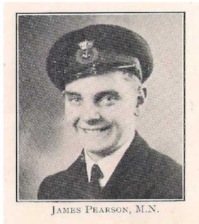
Second Radio Officer Merchant Navy

Lost at sea off the coast of Brazil when SS Observer was torpedoed, 6/12/42