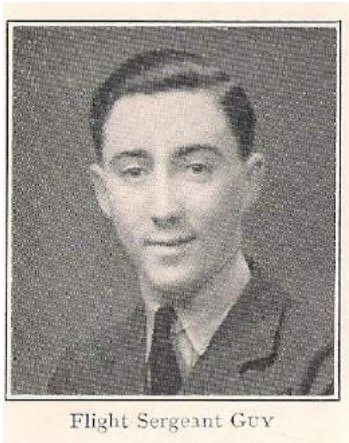
Flight Sergeant (Air Gunner)