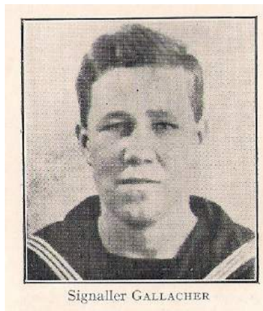
Ordinary Signalmán Royal Navy