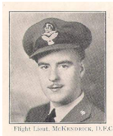
Flight Lieutenant Royal Air Force