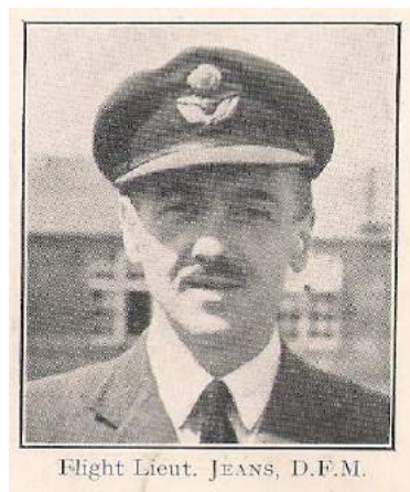
Flight Lieutenant Royal Air Force

Flight Engineer (Leader) on Liberator aircraft, No. 120 Squadron (Ulster and Iceland). Awarded D.F.M., 17/1/44. The citation states that he "served with distinction on anti-submarine operations for a period of 18 months. He was a member of an aircraft crew which attacked and sank an enemy submarine. By skilful operation of a camera he obtained an unusually fine record of the action".