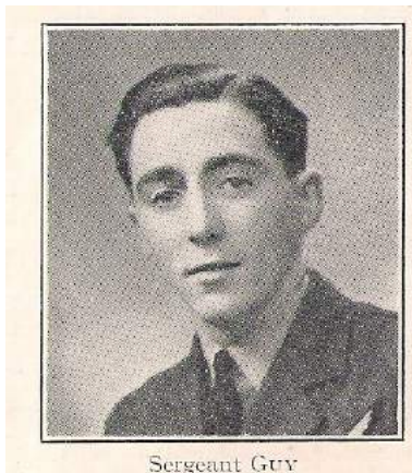
Sergeant (Flight Engineer) Royal Air Force Volunteer Reserve

Flight Engineer in Lancaster bomber, No. 514 Squadron, Waterbeach, Cambs. Killed on operation to Caen, Normandy, 30/7/44. Body recovered from the sea off the coast of Normandy by one of HM Ships and buried at sea