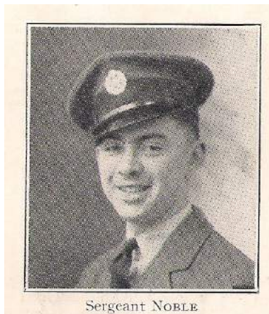
Sergeant (Wireless Operator/ Air Gunner) Royal Air Force Volunteer Reserve

Reported missing, presumed killed, in Wellington bomber, Middle East, 26/10/42