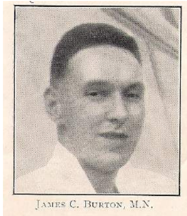
Chief Engineer Officer Merchant Navy

Marine Engineer on a troop carrier. Ship torpedoed off West African Coast, 24/12/43. Missing, presumed drown. Age 33