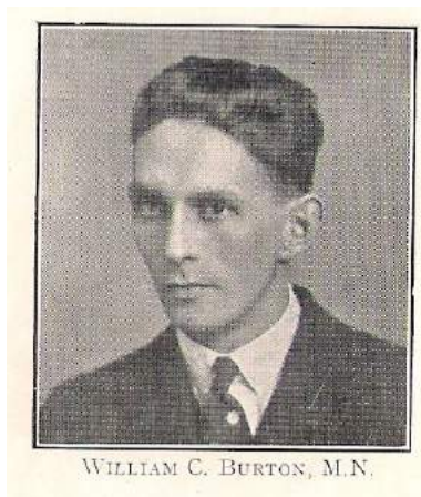
Chief Engineer Officer Merchant Navy

Ship carrying ammunition torpedoed in Atlantic in March 1942; no survivors. Age 40.