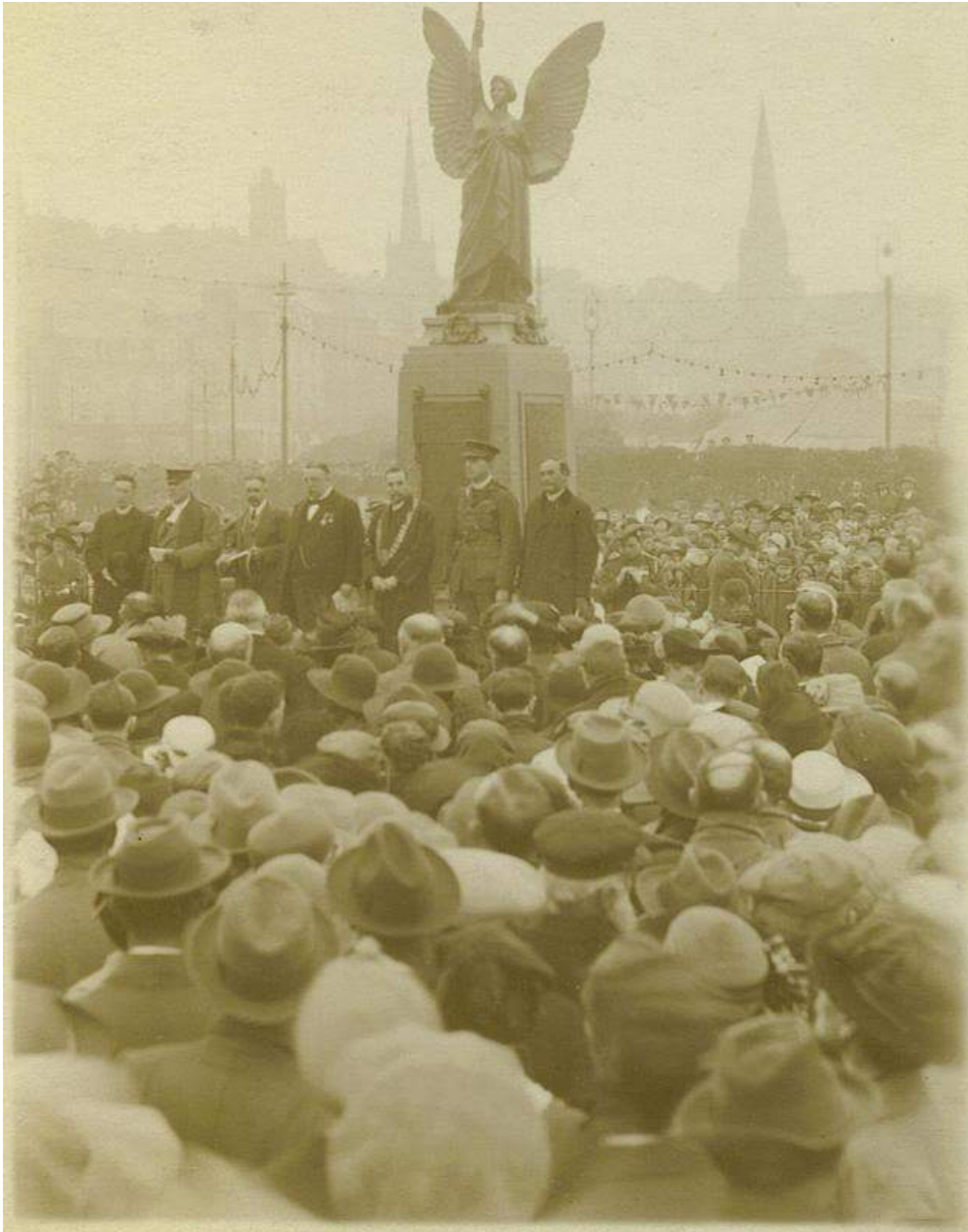
Unveiling of the war memorial at Rothesay

Menin Road South Military Cemetery, III.L.30