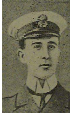
Rothesay Royal Australian Naval Bridging Train Died at Sea of malaria, 7 th April 1916 Chatby Memorial

Killed in action in France, 4 th November 1918 Cross Roads Cemetery, Fontaine-Au-Bois, IV.A.10